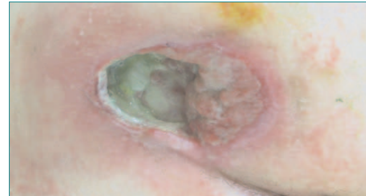
12/06/02: Wound culture positive for Vancomycin Resistant Enterococcus and resistant Pseudomonas Aeruginosa. Ultrasonic Assisted Wound Treatment initiated. Measurement 6.0cm x 3.5cm x 2.2cm