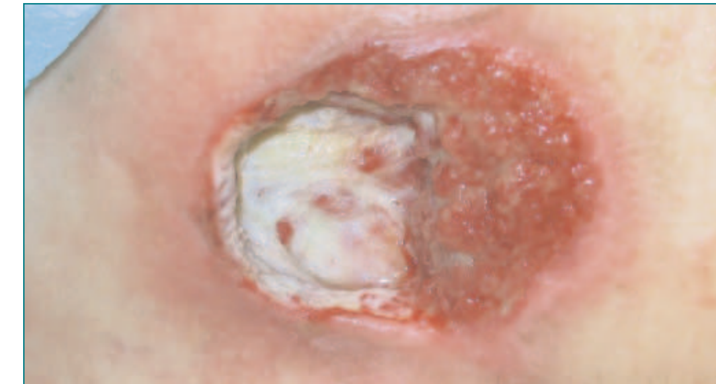
12/06/02: Post-Ultrasonic Assisted Wound Treatment. Quantitative wound culture obtained.