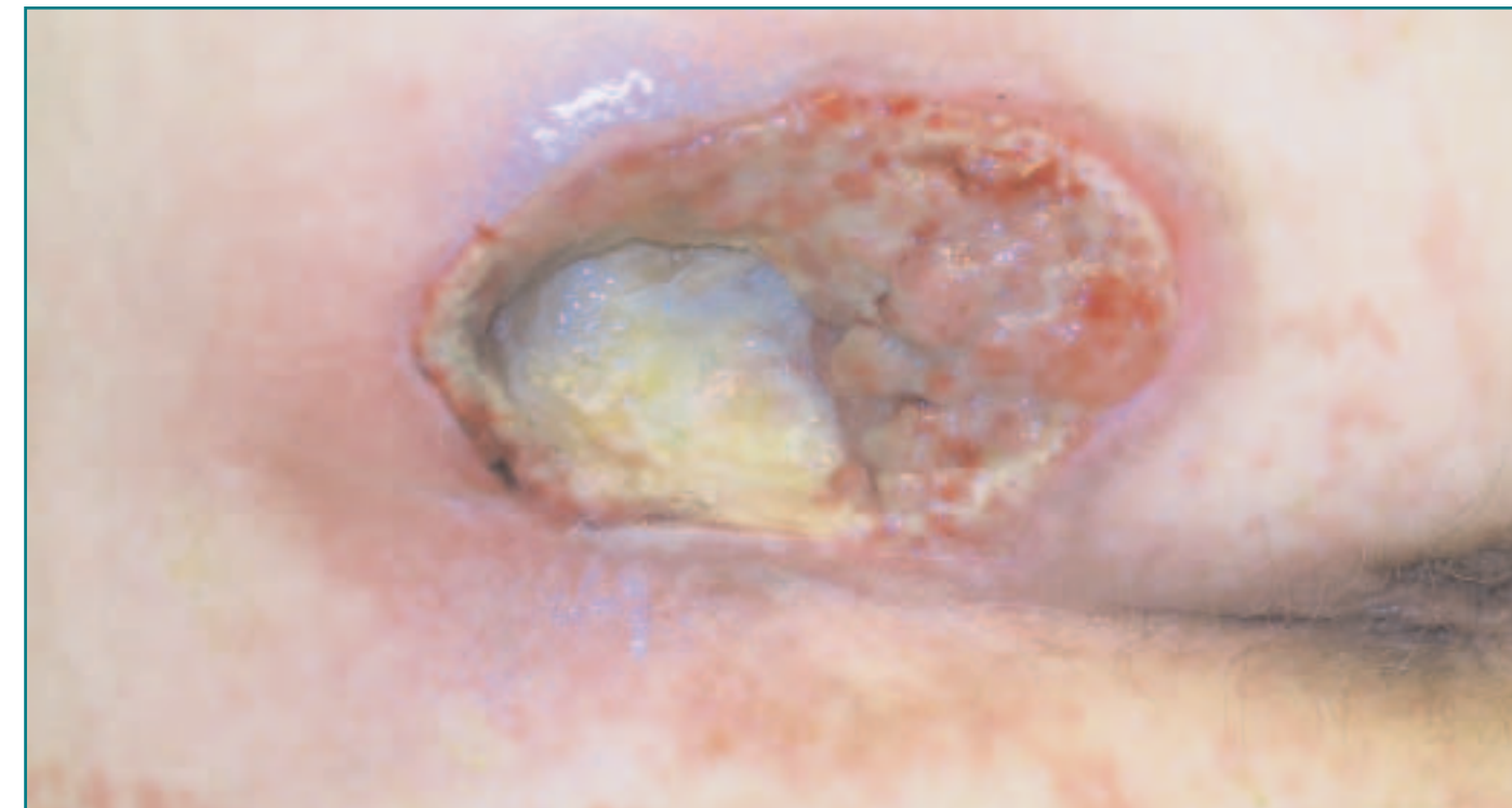
Appearance after 4 weeks of enzymatic agent. Persistent densely adherent area of fibrin slough. Sharp debridement preformed. Cultures obtained. Measurement 7.0cm x 5.0cm x 1.9cm

ment of a stage III right ischial pressure ulcer that developed during an acute care hospitalization (07/2002). The wound was deteriorating despite offloading efforts including a pressure relief mattress and wheel chair cushion. Following initial consultation, her wound care regimen was modified to include enzymatic debridement and moist wound healing.