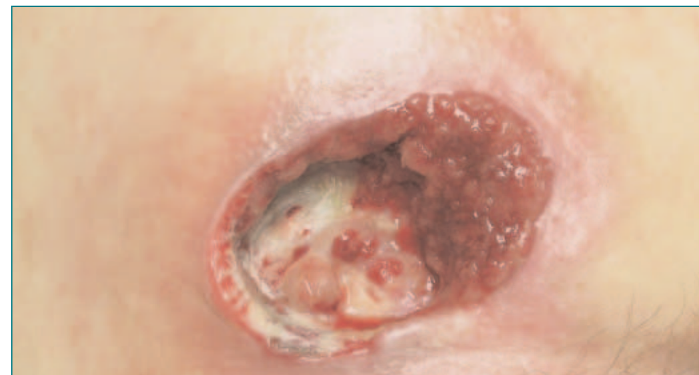
2/13/02: Wound culture negative for VRE or Pseudomonas. Wound again treated with UAW. Pre and post UAW quantitative wound culture obtained. Measurement 5.8cm x 3.4cm x 1.6cm